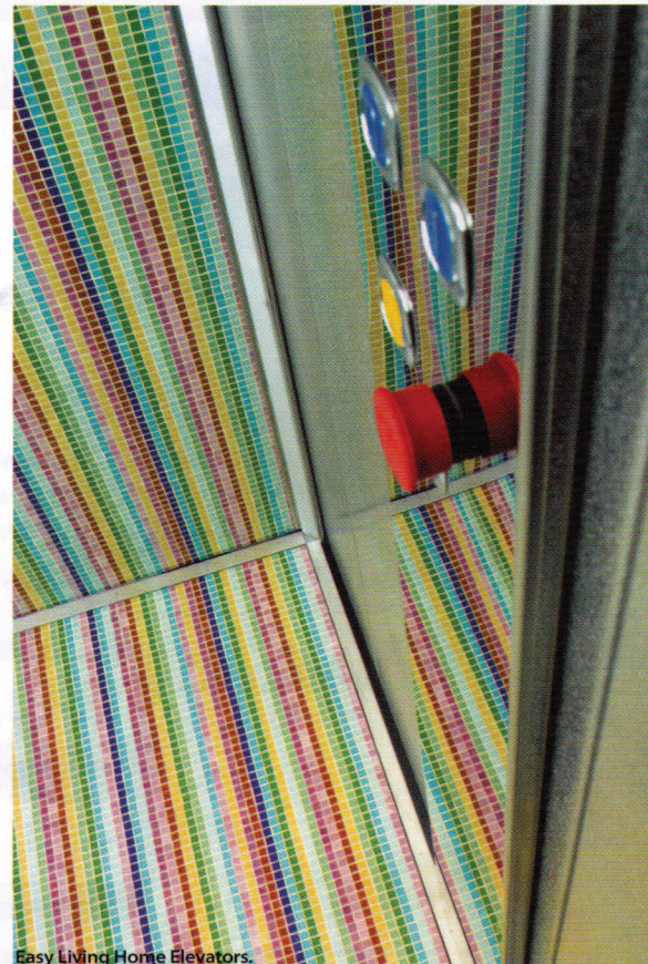
Easy Living Home Elevators.