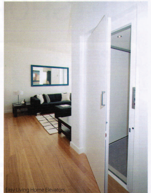
Easy Living Home Elevators.

Lukas Marneros: Home elevators have minimal environmental impact. Low power consumption and maintenance requirements have been specifically designed for private residences. ■