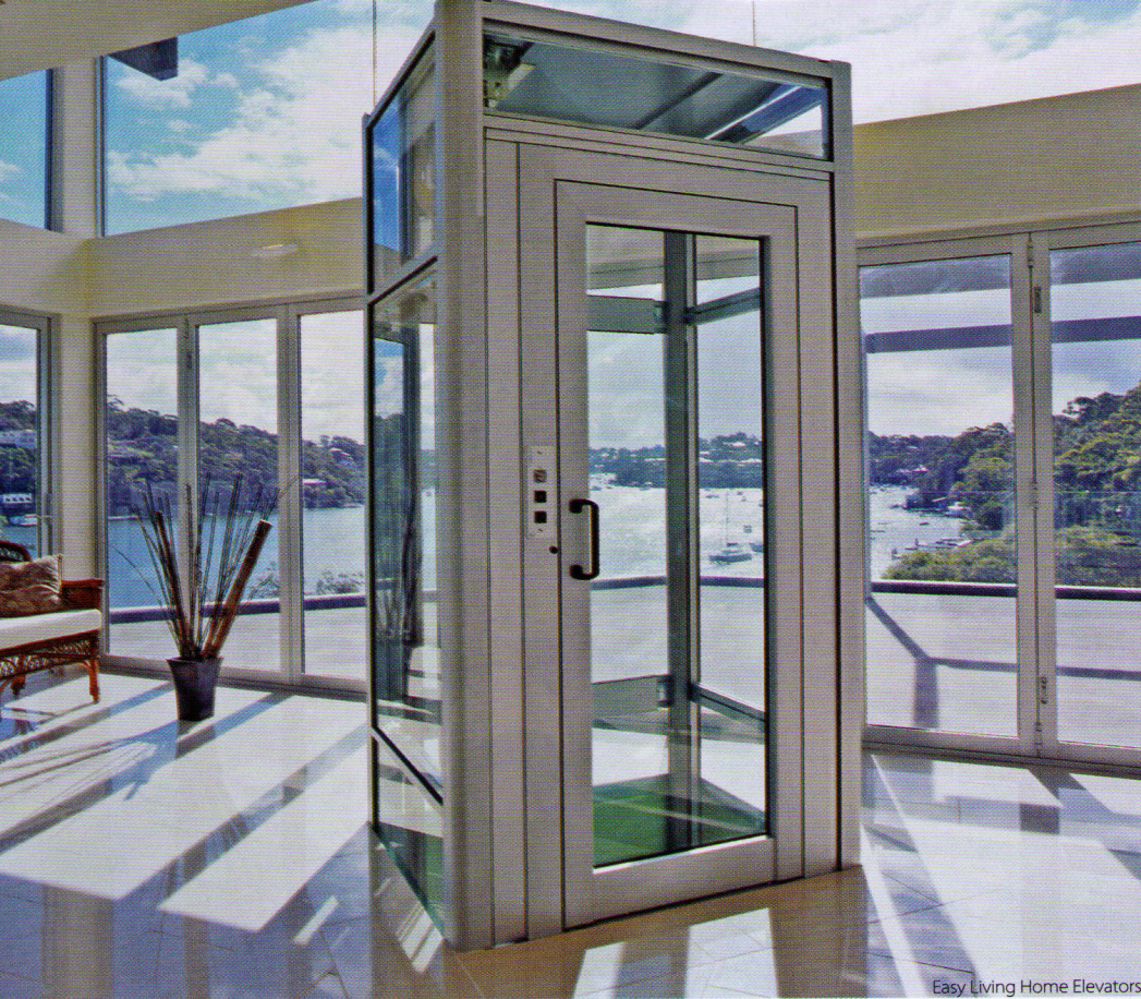
Easy Living Home Elevators

Bernard Edwards: Home elevators from Lift Shop have customisable options including mirrors, glass walls, custom ceilings, decorative and coloured stainless steels, and manufactured stone floors. There is also the Freedom Lift, which is available in a range of popular sizes and a huge range of finishes. This lift is also available in three popular models to meet all tastes and budgets and a choice of either swing or sliding doors.